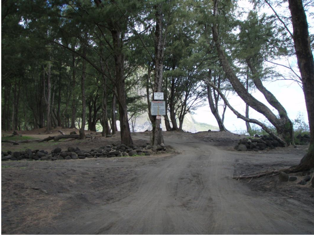
Almost to the end of the road. River is straight ahead and the beach is to the right.