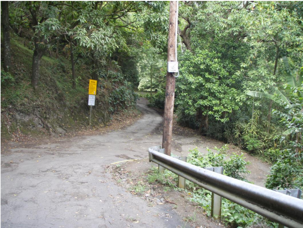
Take this first right turn. Road will take you to the beach.