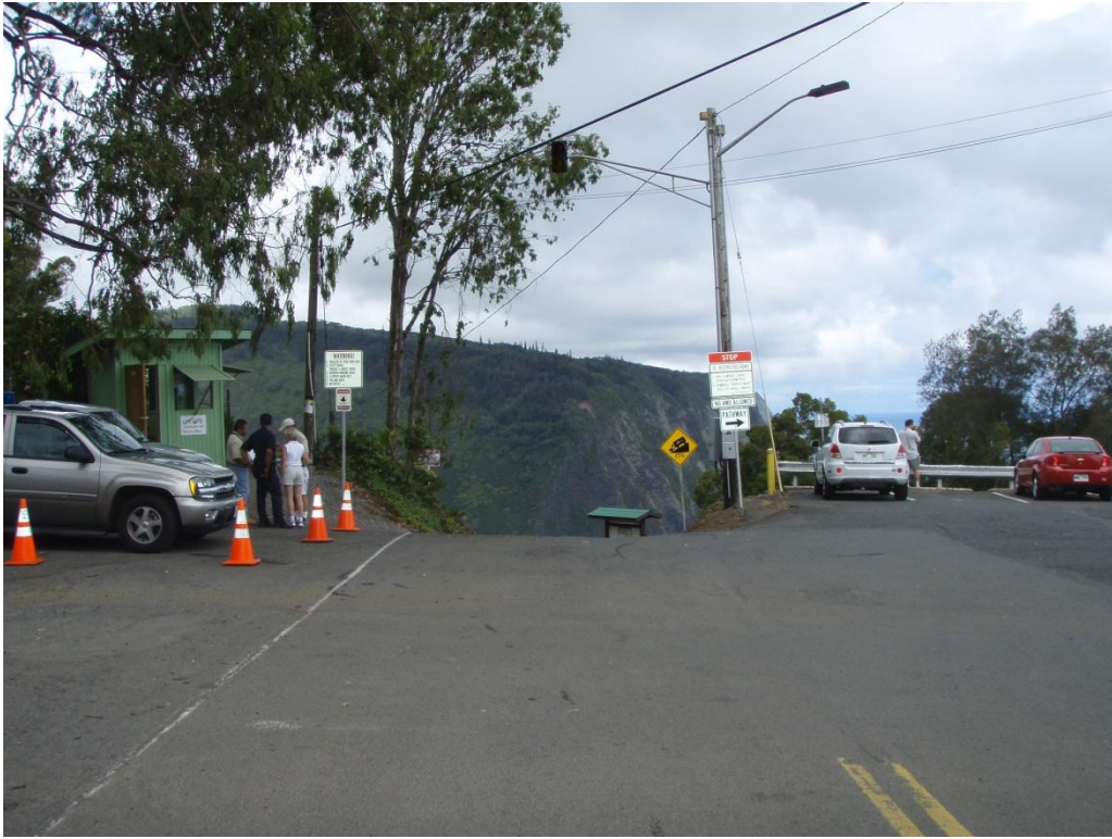
Road from Waipio Lookout to the Valley floor. Use four wheel drive in low gear.