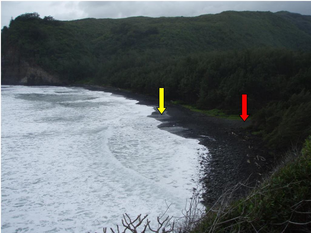
Photo from the trail. Sample site at the yellow arrow and red arrow is in the area of the stream mouth. Stream normally dry.