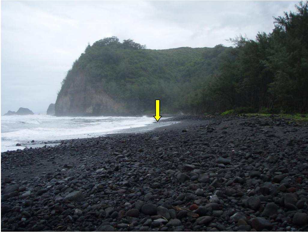
Sample site from the stream mouth.