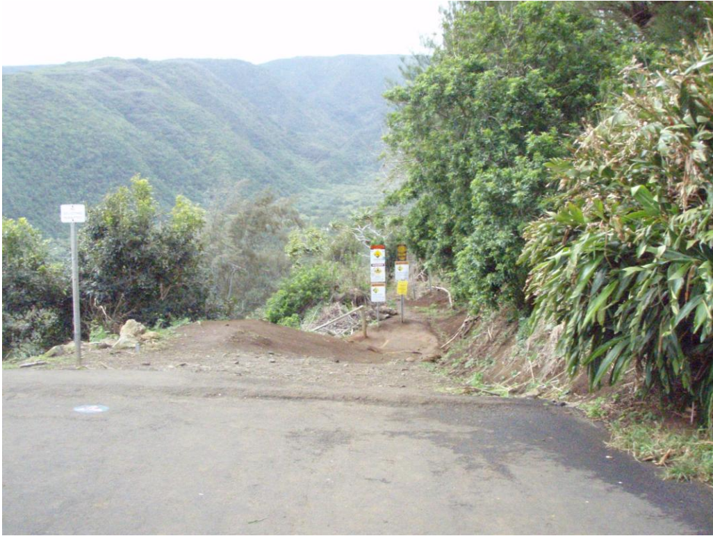
Head of trail down into Pololu Valley at the Pololu Overlook at the end on Highway 270