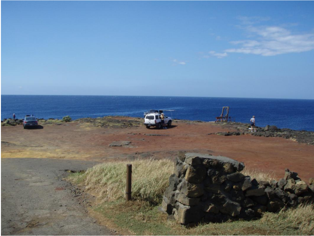
Boat launching derrick just off Kalae Road. Sample site to the left.