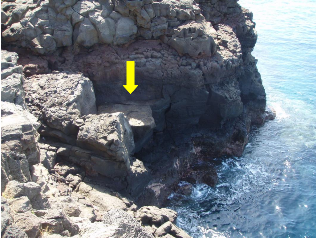
Close up of the ledge