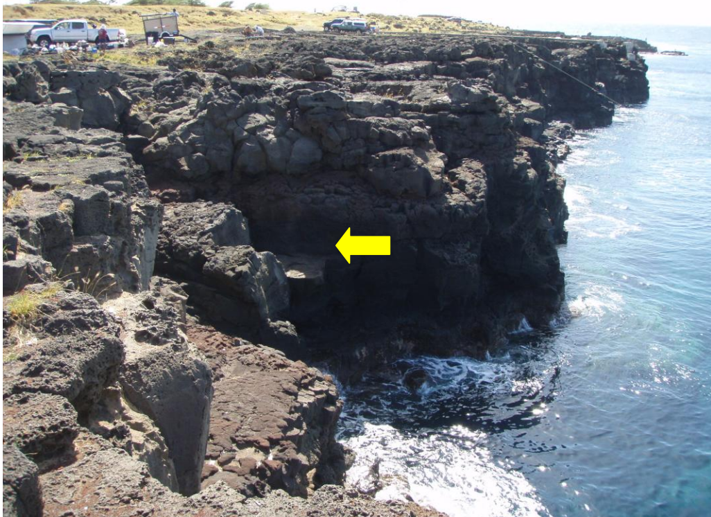
Take sample from the flat ledge that is halfway down the cliff. Shown by arrow.