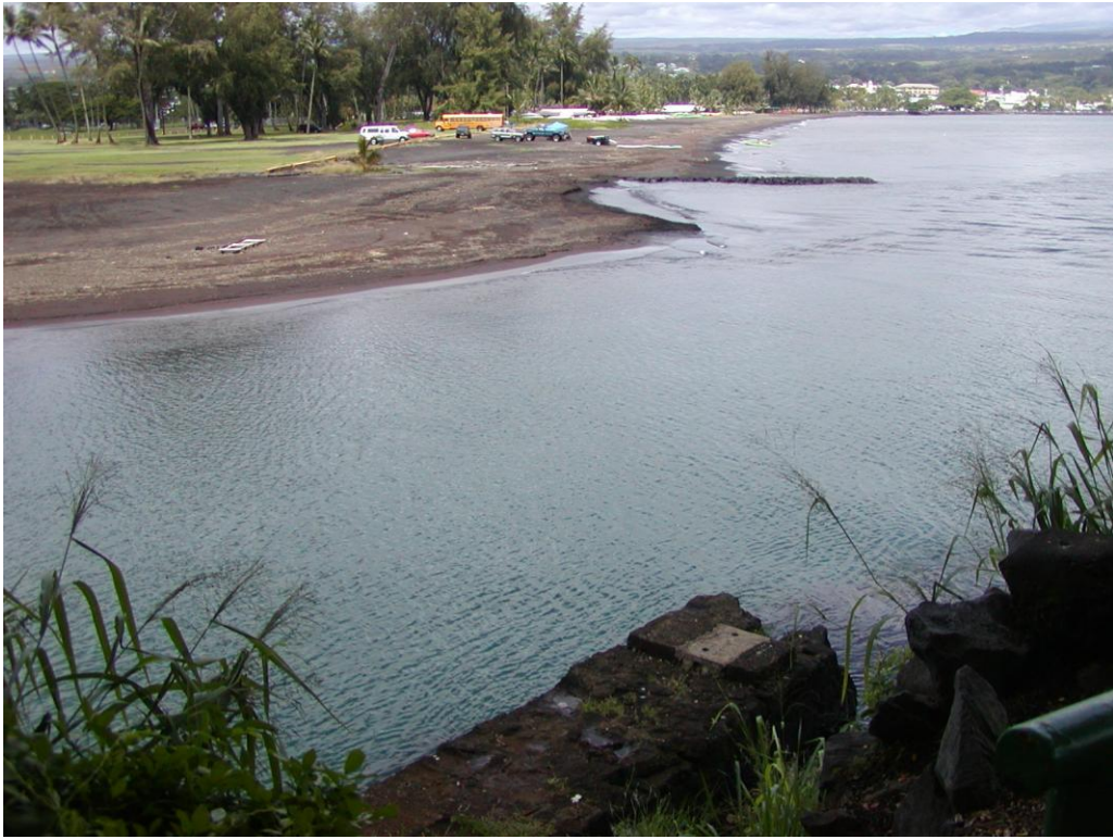
Sample taken from the stone and concrete platform.