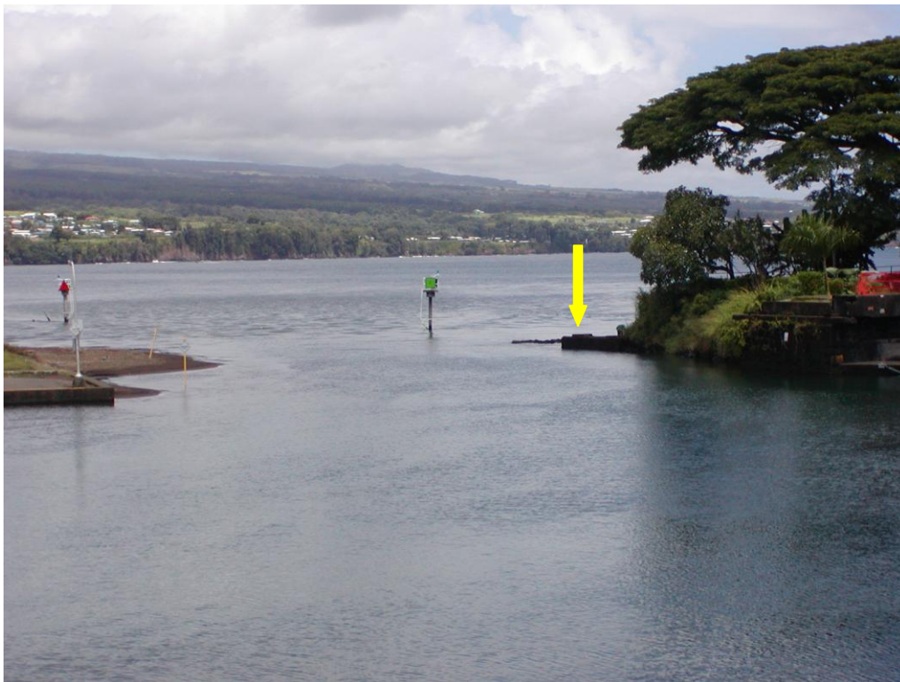
Sample from the stone and concrete platform shown by the yellow arrow.