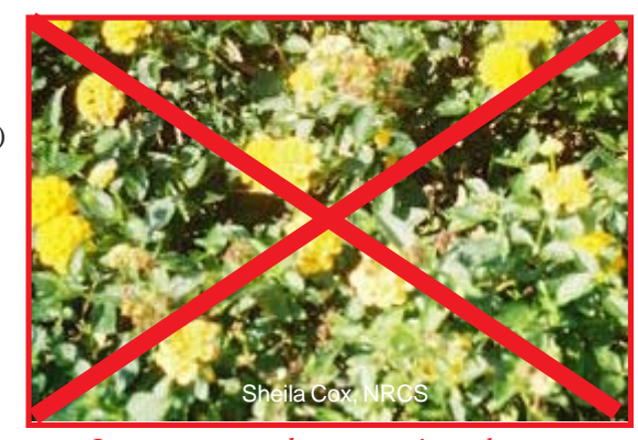
Lantana crowds out native plants.