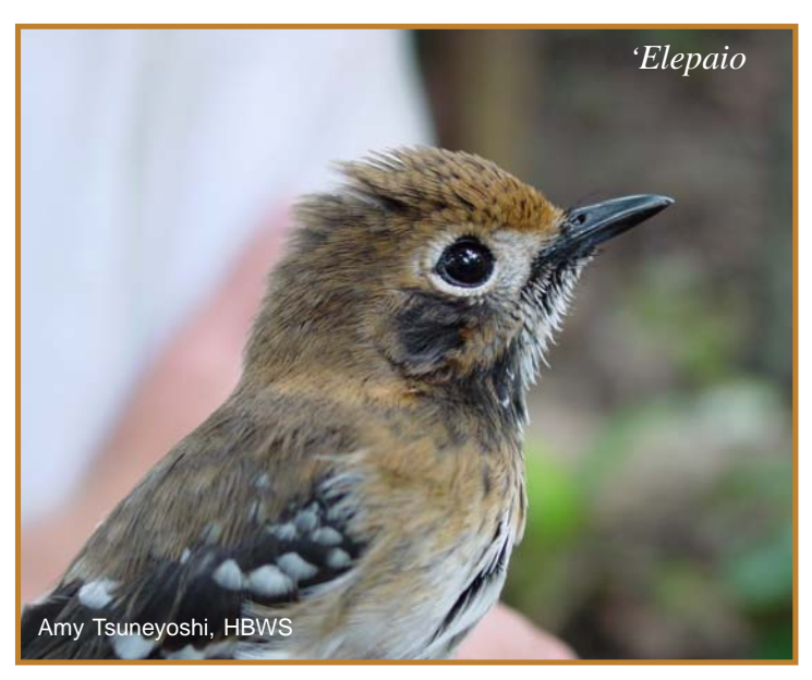
Federally endangered, these active and feisty, wren-like flycatchers are found on Kauai, Oahu and Hawaii.

All wildlife including butterflies, birds, and bats are vulnerable to many pesticides and other chemicals. So are children! Protect your family's health and Hawaii's wildlife by minimizing chemical use . If you use chemicals, always follow label instructions .