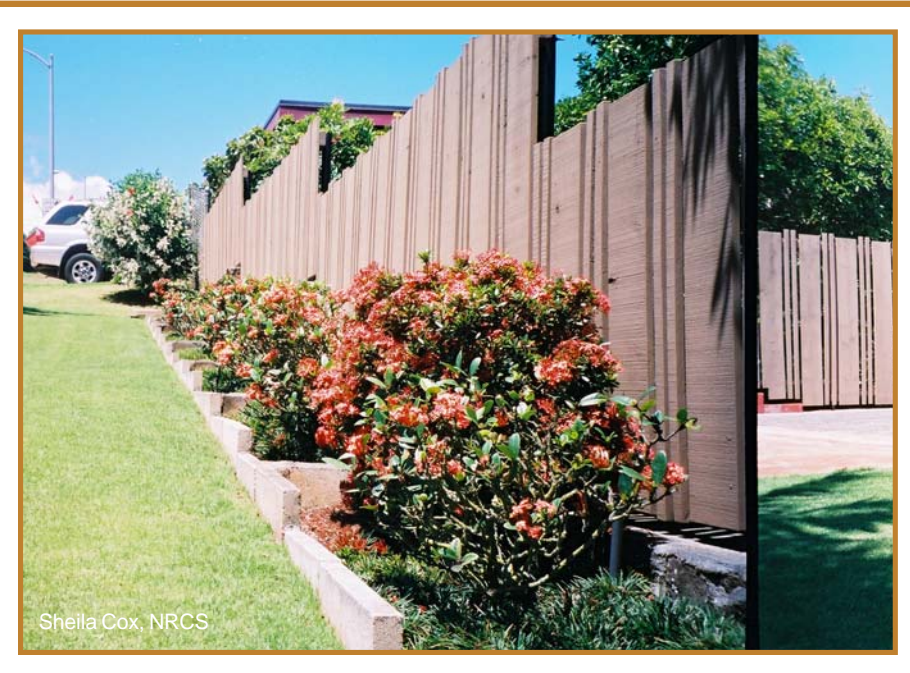
Terracing makes gardening possible on slopes.