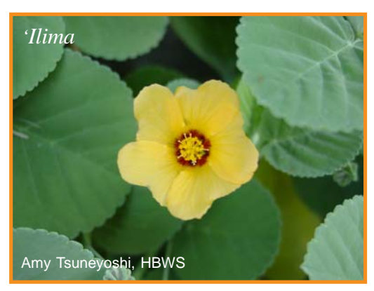
In general, native plants such as 'Ilima do well without supplemental fertilizer applications.

The key to good nutrient management in your backyard is a reliable soil test. Without a soil test, you could be applying too much, too little, or the wrong nutrients. You'll want a separate soil test for your lawn and for your garden.