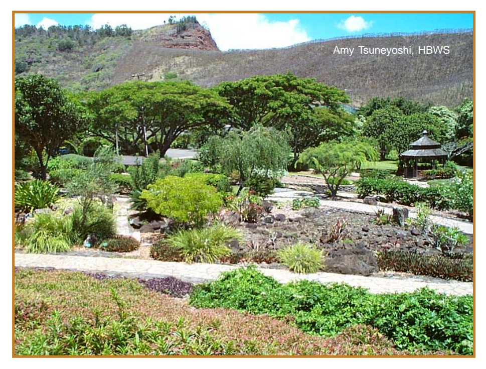
The Halawa Xeriscape Garden has plant samples on display.

Xeriscaping is a systematic concept for saving water in landscaped areas. This practice combines irrigation techniques and using drought-tolerant plants and grasses. Techniques might include automatic timers, moisture sensors, rain shutdown devices, and low output sprinkler heads, emitters, or drip lines.