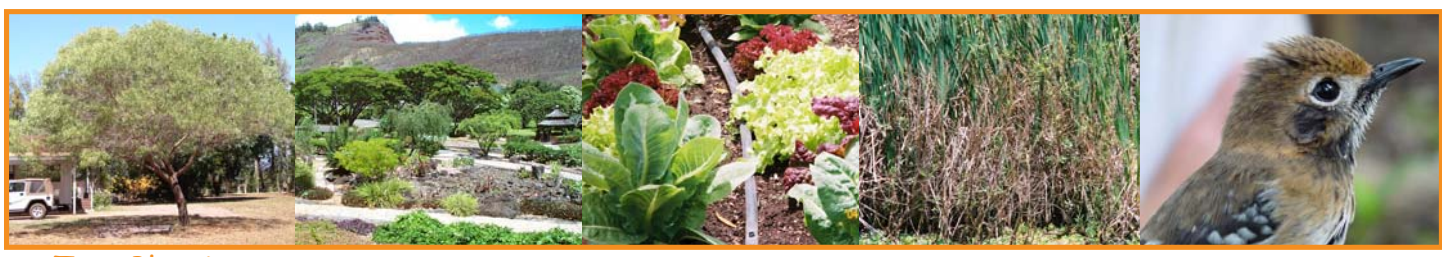
Tree Planting Page 14