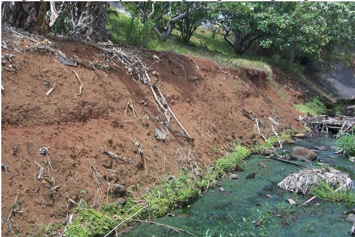
Figure 1. Degraded stream channel – note algae in the water and steep, eroded, unvegetated bank

The largest source areas for sediment loads seem to be residential areas and cemetery lands (combined, about 65% of the total loads), with about 1/3 of the total loads contributed by Basins 3 (largest residential load) and 4 (no cemetery load, largest forest load). Basins 1 (large cemetery load), 7 (large residential load), and 9 (golf, residential, and forest loads) combine to supply an additional 38% of the sediment load (see report, Table 5.4a). Loads from cemetery source areas may have less long-term significance than suggested by these figures since construction projects and temporary dirt stockpiles may have contributed to high concentrations measured during the field study period. On the other hand, the poor vegetation and slope conditions observed along the stream banks suggest that sediment loads from erosion and scour of the stream channel itself during larger storm events may have great long-term significance (e.g. see Figure 1. below).