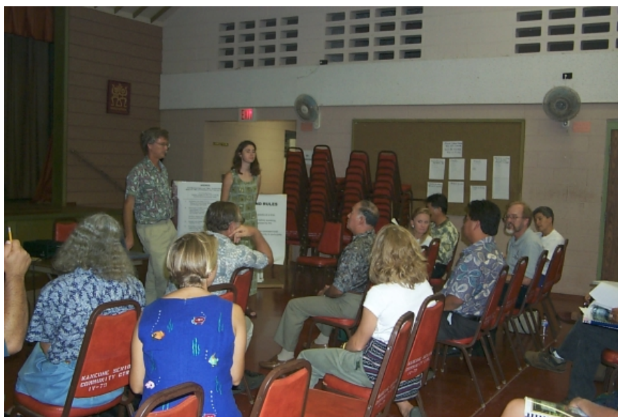
Figure 3. Kawa Stream TMDL Public Information Meeting, October 2001

TMDL implementation suggestions were solicited from community members and are summarized in the final section of this document. The DOH Environmental Planning Office is continuing to stimulate public participation in order to produce a Kawa Stream TMDL Implementation Plan developed with input from a range of concerned residents and responsible government agencies. The Plan is intended to guide the community and agencies in their work to improve Kawa stream and to assist them in identifying and obtaining funds to support projects that reduce stream pollution and improve stream water quality.