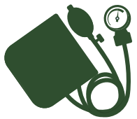
high blood pressure