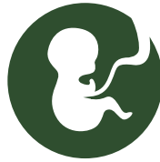
your baby being born too early