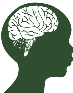
damage the brain and nervous system