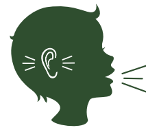
cause hearing and speech problems