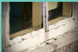
Paint / Dust