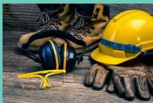
Work / Hobbies