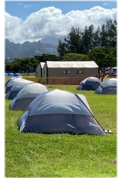
POST shelter set up at Ke'ehi Lagoon Beach Park for O'ahu's homeless persons.

Homeless persons will be offered a RED or YELLOW POST Facility unit based on availability and the request of each individual, couple, or family . If no symptoms develop during the 15-day lock down in a RED POST, persons will be moved into the BLUE POST Facility and are eligible for shelter intake, housing, or other services.