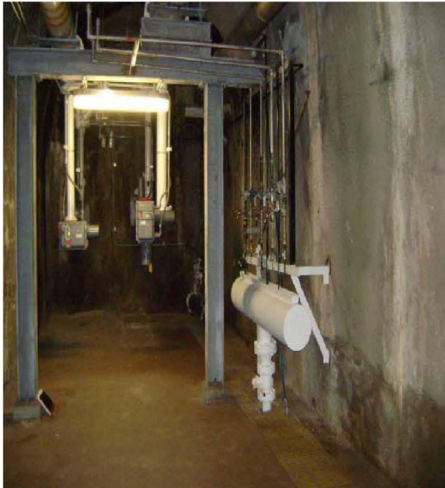
Figure 2: Typical Tank Bottom Access