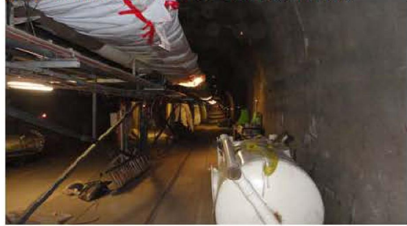
Lower tunnel conditions during blasting