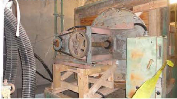
TK 5 dust collection unit blower motor