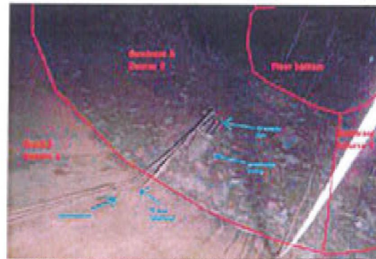
Paint / Coating – Chips and pieces along the bottom after pressure washing.