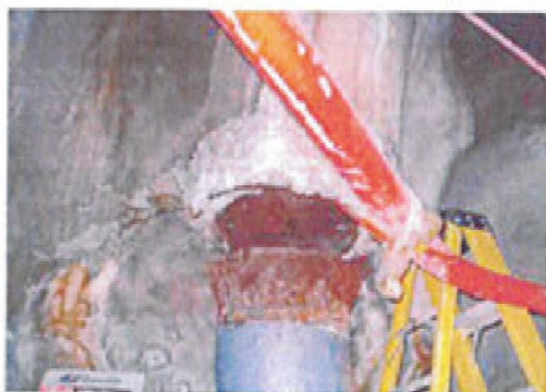
Ventilation System – Area repaired where foam was installed for ducting. Metal sheeting installed and sealed for ventilation process.