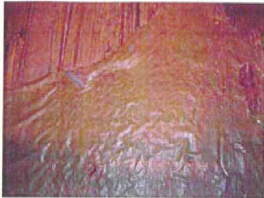
Paint / Coating – Disbonded & blistered