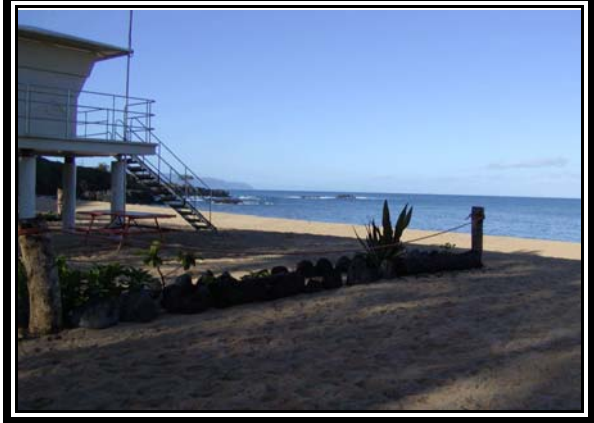
Waimea Bay Shoreline 000172