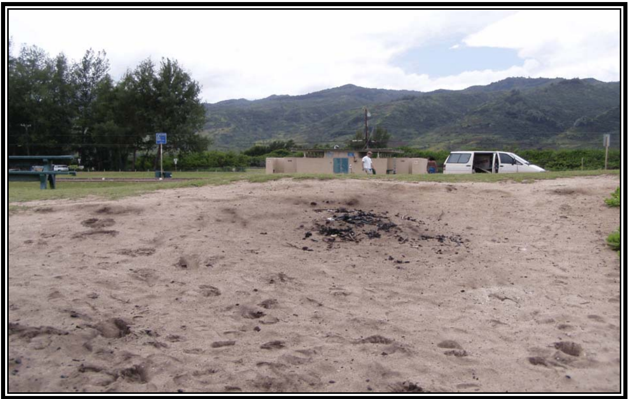
Mokuleia Shoreline 000169