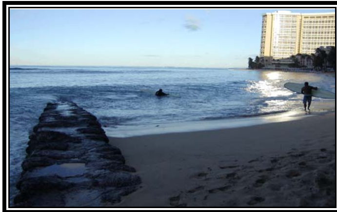
Tavern Beach 000160