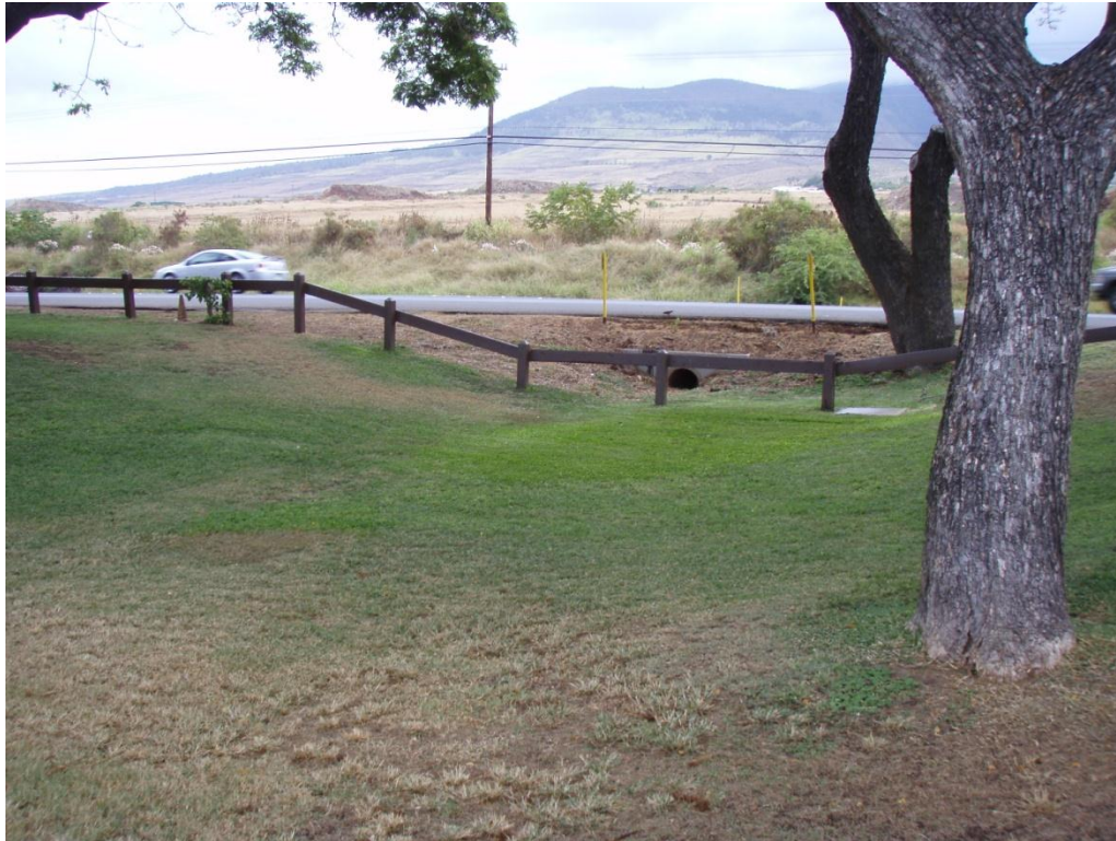
Culvert which drains the mauka shoulder of Honoapiilani Highway