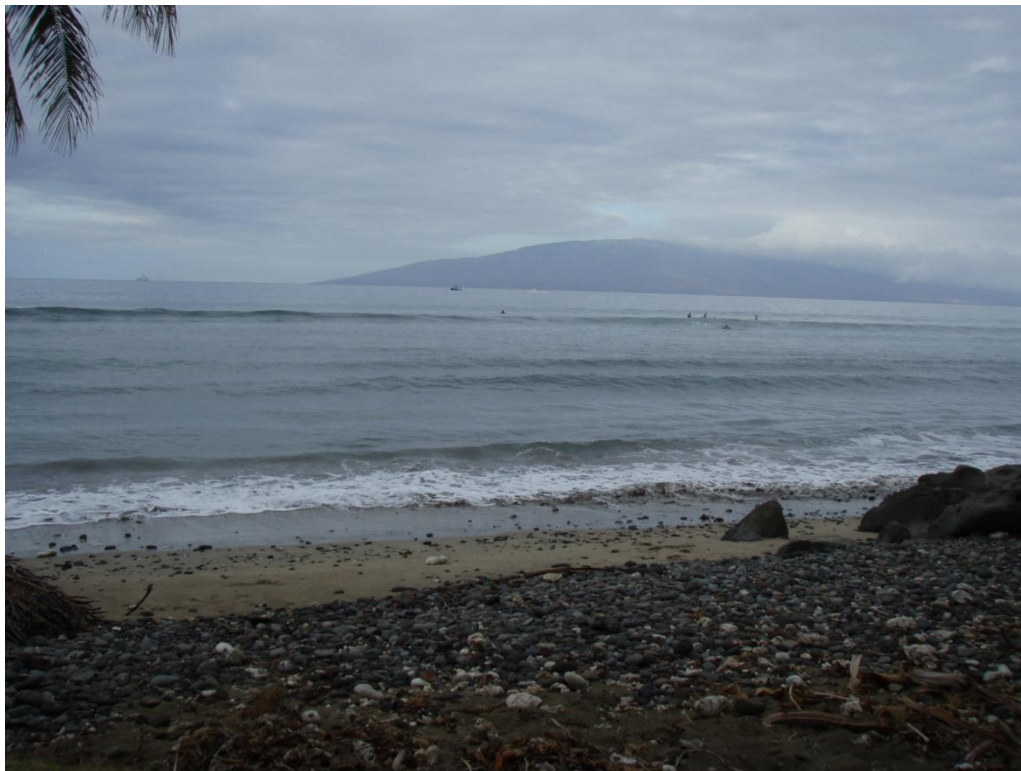
View of sample site as seen from makai shoulder of Honoapiilani Highway