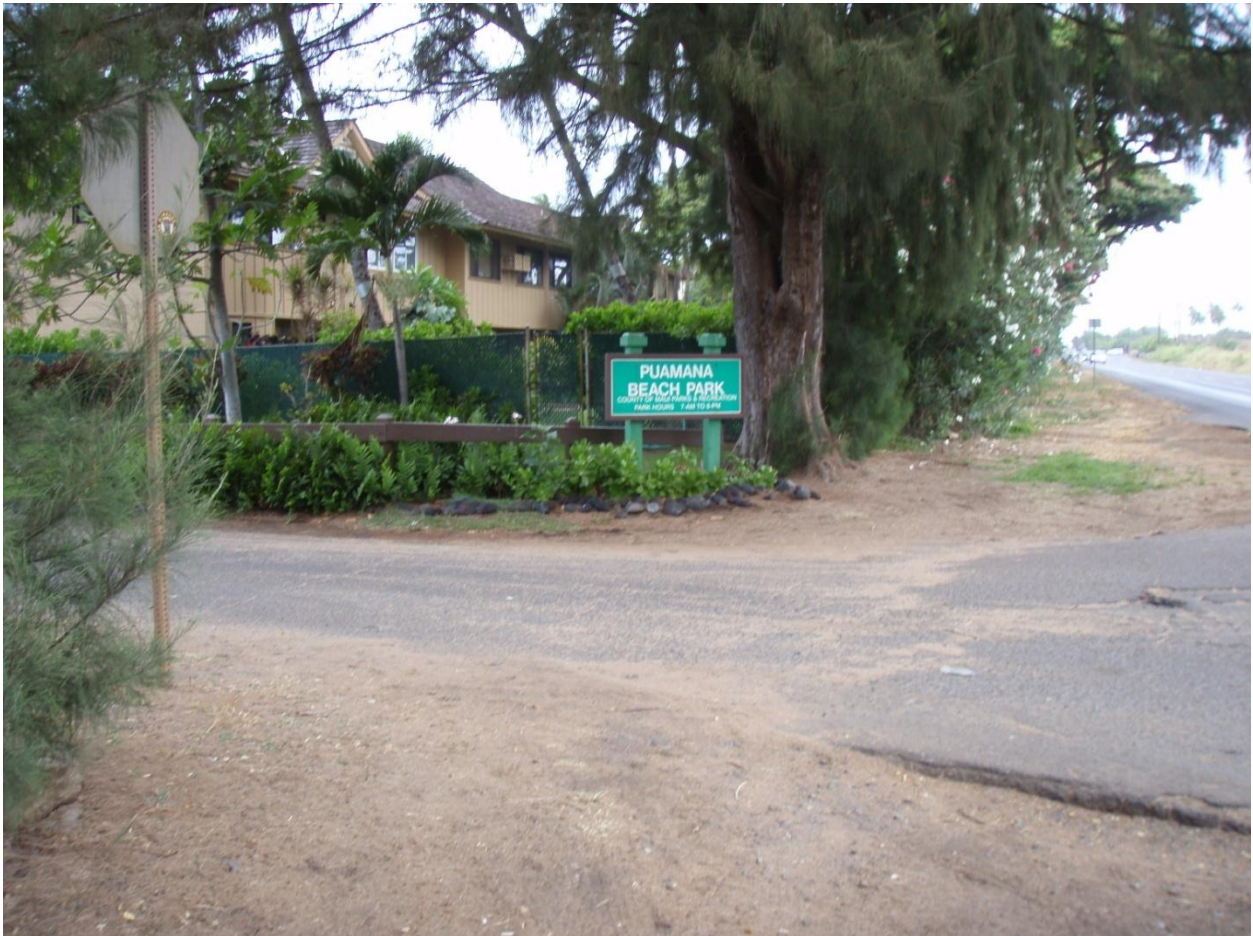
Entrance sign to Puamana Beach Park. The park is located at the southern end of Lahaina Town.

Comments: The sample site is located on the south end of Puamana Beach Park in Lahaina, Maui. This is a popular surfing spot. The beach is a mixture of sand and cobble.