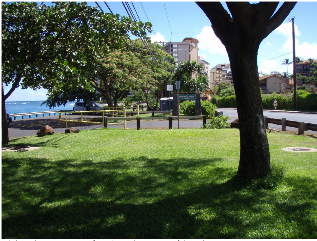
Pohaku Park entrance as seen from the southern section of the park

Pohaku Park is also called "S-Turns" and is located at the border between the Kahana and Mahinahina districts of West Maui. During times of high surf, it is a popular surfing spot. There is a small sandy beach on the southern end of the park. Most of the shoreline fronting the park is rocky. A large culvert empties into the sandy beach area and there is a Maui County sewer pump station located across of the street from the southern end of the park. Shark attacks have occurred in this area.