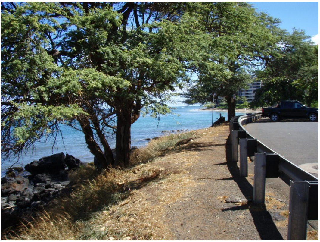
Rocky shoreline at center and northern sections of Pohaku Park