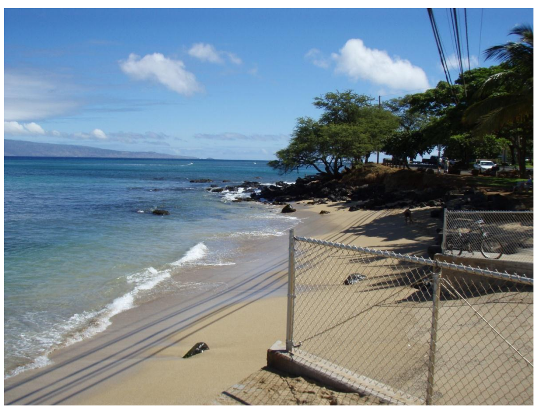
Sandy beach at southern end of Pohaku Park