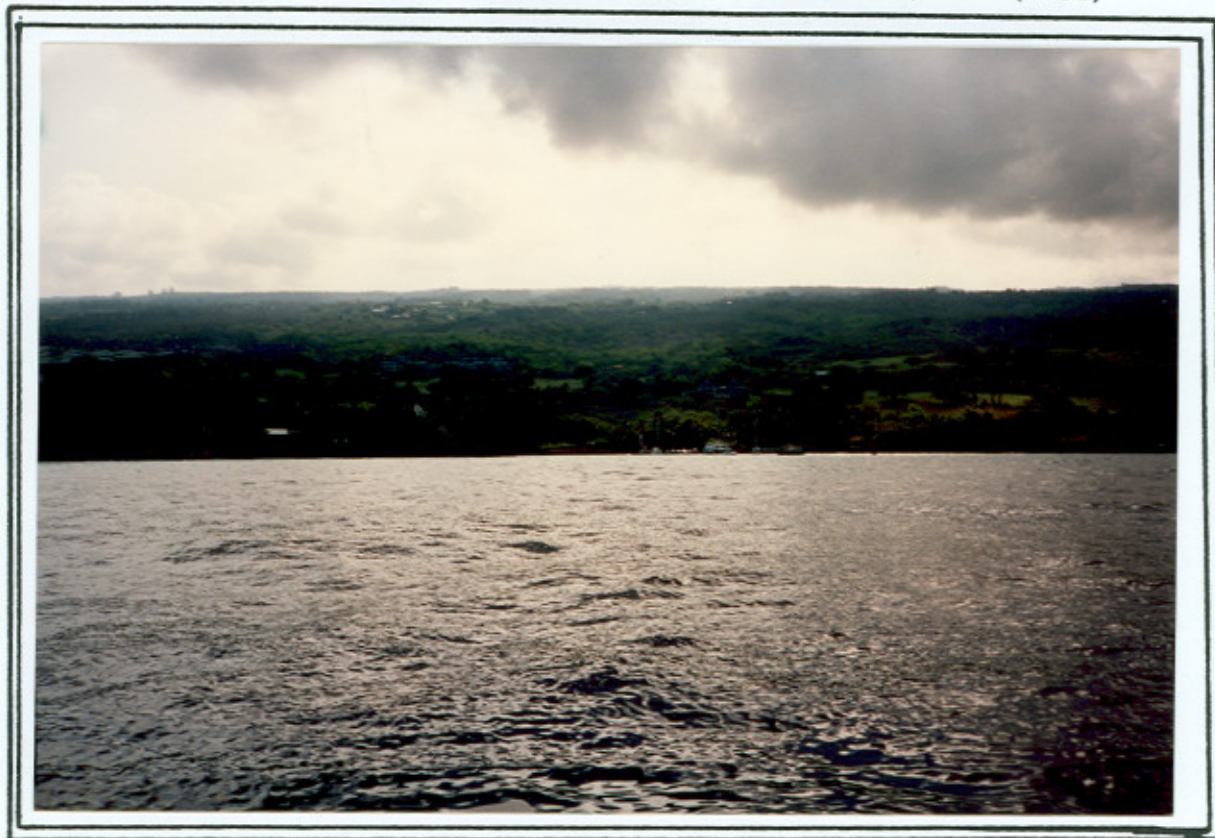
KEAUHOU BAY EMBAYMENT 1231