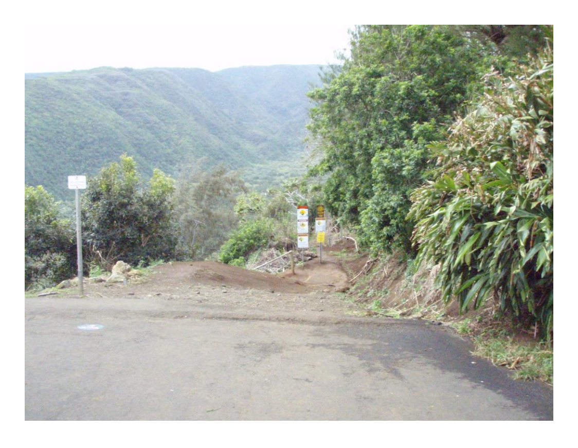
Head of trail down into Pololu Valley at the Pololu Overlook at the end on Highway 270