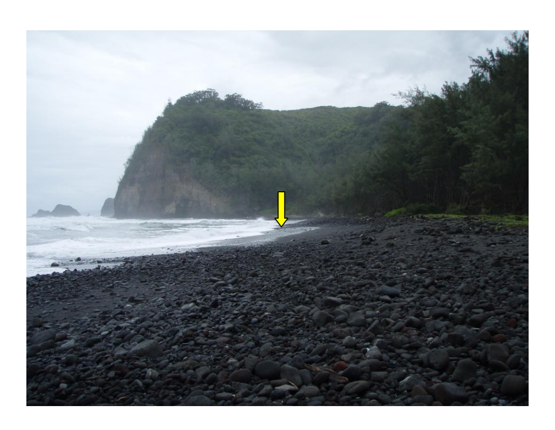
Sample site from the stream mouth.