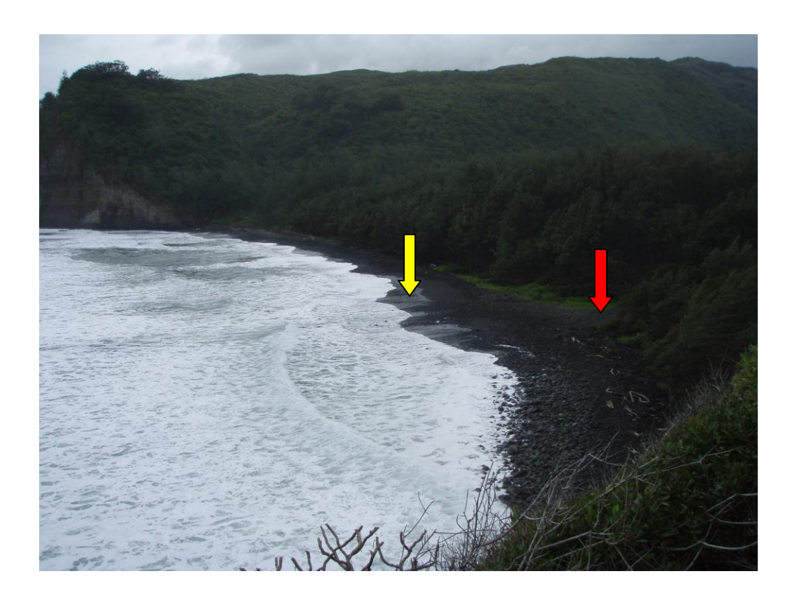
Photo from the trail. Sample site at the yellow arrow and red arrow is in the area of the stream mouth. Stream normally dry.