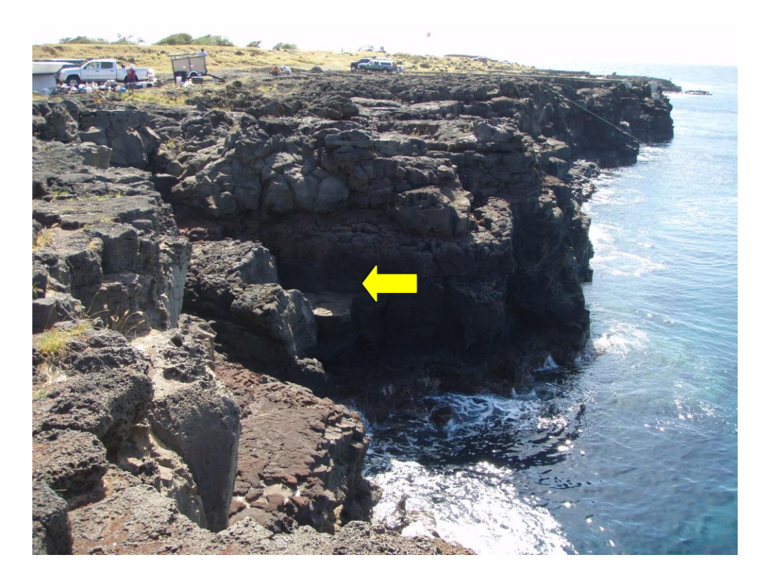
Take sample from the flat ledge that is halfway down the cliff. Shown by arrow.