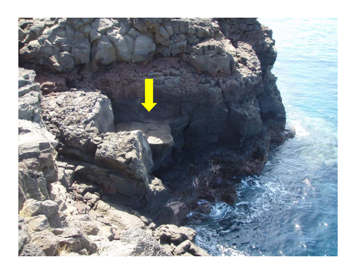
Close up of the ledge