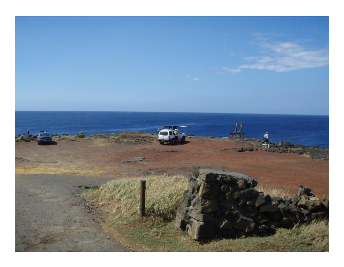
Boat launching derrick just off Kalae Road. Sample site to the left.