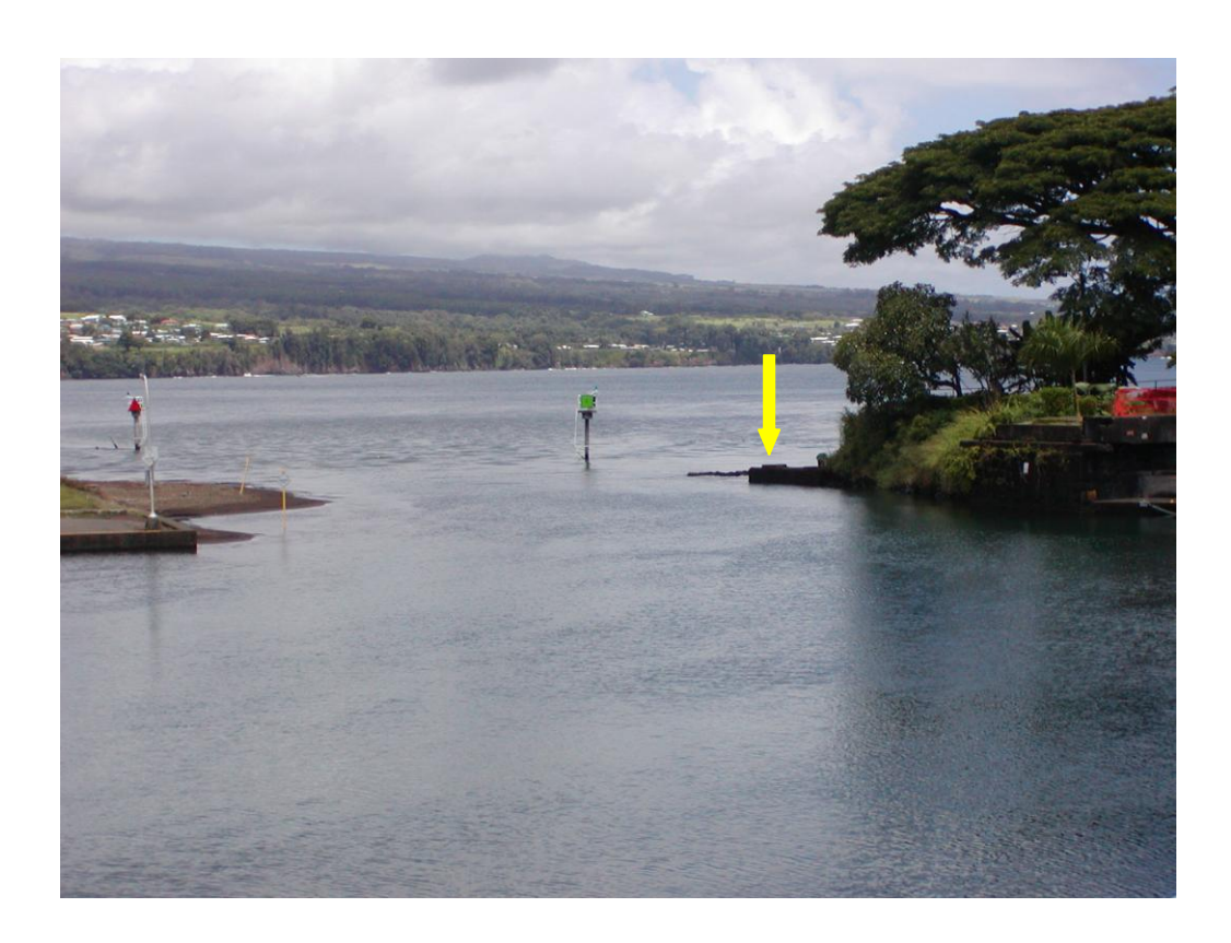
Sample from the stone and concrete platform shown by the yellow arrow.