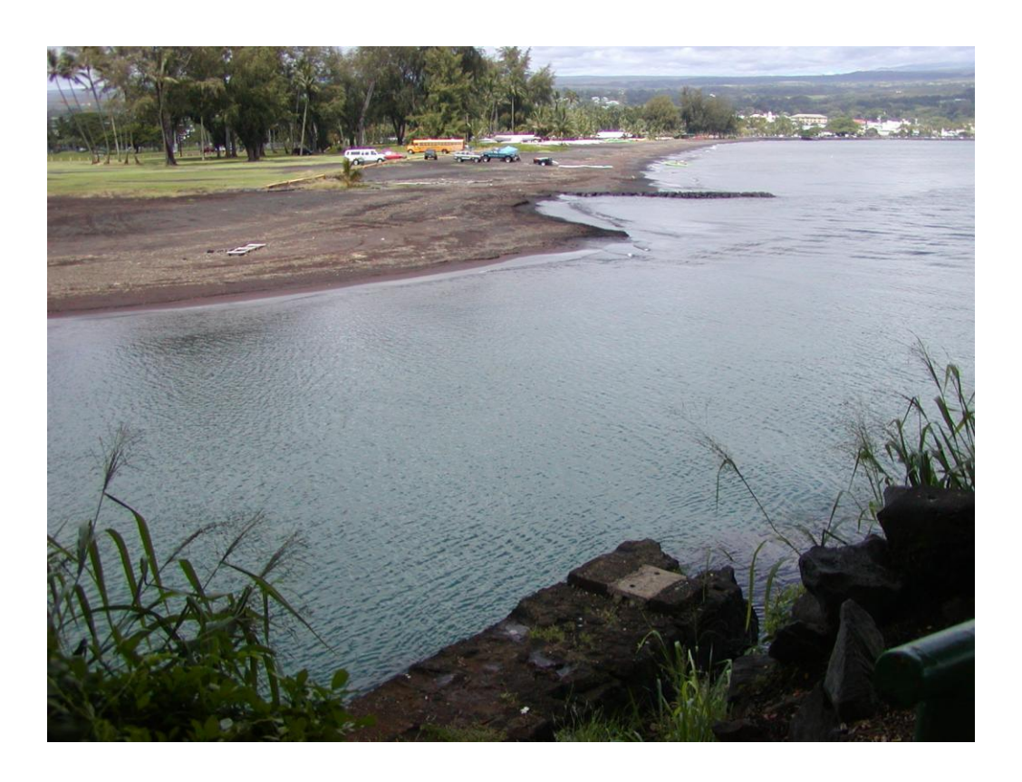
Sample taken from the stone and concrete platform.